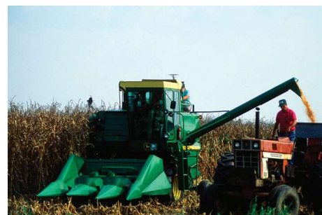
Equipment for planting and harvesting of bio-pharm crops must be dedicated to that purpose, i.e., the equipment cannot be used with any other crop.

Research on PMP crops has been ongoing for many years in laboratories, greenhouses, and field trials. In 2002, PMP crops were grown at 34 field sites totaling 130 acres in the U.S. Three PMPs currently undergoing evaluation in clinical trials are designed to target non-Hodgkins lymphoma, cystic fibrosis, and E. coli /traveler's diarrhea (Biotechnology Industry