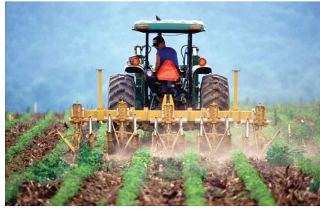
Tractors and tillage equipment must be thoroughly cleaned before being used with other crops.

Risks are not uniform for all bio-pharm applications, but will vary depending on the nature of the pharmaceutical product, the crop and tissues in which the PMP is produced, and the environment in which