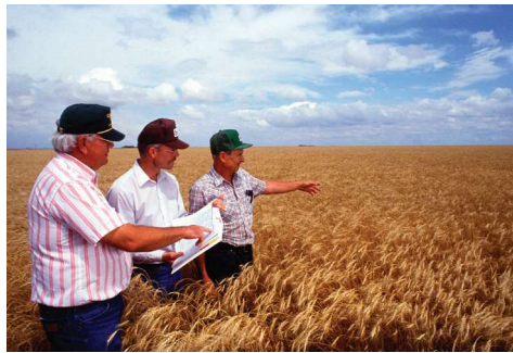
All workers involved with PMP crop production must participate annually in an APHIS-approved training program on the required procedures for growing these crops.

Many protein-based drugs are currently produced in sterile fermentation facilities by genetically engineered microorganisms or mammalian cell cultures in stainless steel tanks (Felsot, 2002). Because these fermentation plants have huge capital construction costs, industry has been unable to keep up with the growing demand. For example, the biotech company Amgen is reportedly unable to meet demand for Enbrel, a protein-based arthritis medicine made in mammalian cell cultures (Alper,